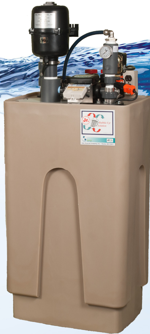
Bubble-Up Jr. ® Interactive ™

Every Bubble-Up is built with safety features, ease of maintenance, aesthetics, and quiet operation in mind.