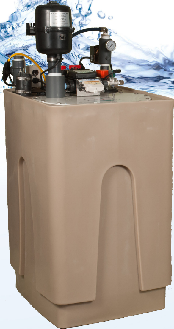
Bubble-Up ® Interactive ™