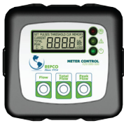
Digital Flow Meter

Water Meter Control for Bubble-Up® Interactive™: