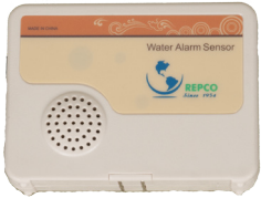
Water Alarm Sensor

Water Alarm Valve for Bubble-Up® Interactive™: